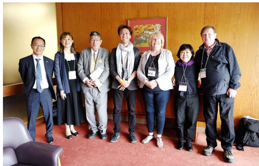
ADI KYOTO 2017