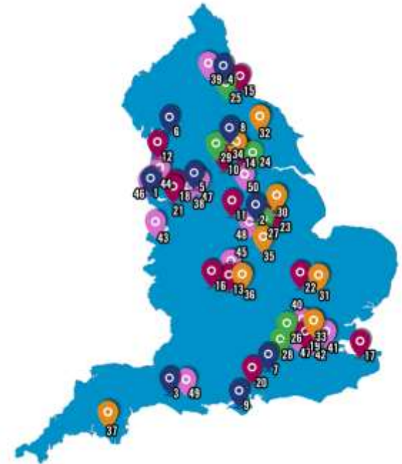
New models of care