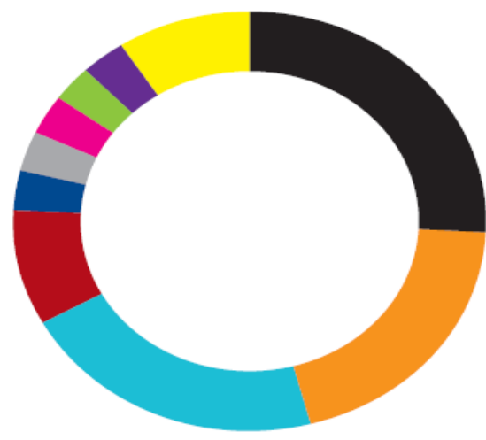
Table I: Dementia Action Alliance Income