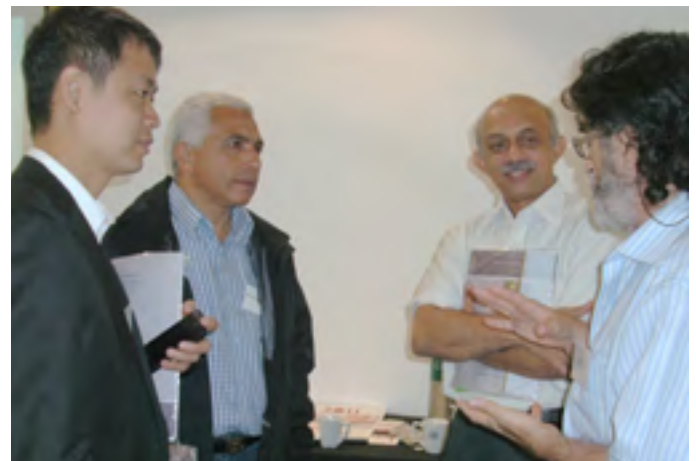
Participants at the Alzheimer University for emerging associations in August 2011

The week following the launch of the report, the United Nations hosted only the second meeting in its history on a global health issue, a Summit on Non-Communicable Diseases (NCDs). ADI joined the NCD Alliance Summit Partners Group in July 2011 to promote the inclusion of Alzheimer's disease and other dementias as a non-communicable disease. Ahead of the Summit, a statement was developed alongside ten age and care-related international organisations highlighting the necessity for ageing, dementia and caregiving to be included in the Summit's NCD recommendations for action.