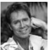
Sir Cliff Richard

Our 2006 international advocacy campaign aims to address this imbalance. Special ADI postcards will strongly encourage governments to put dementia on their agenda and make it a national health priority.