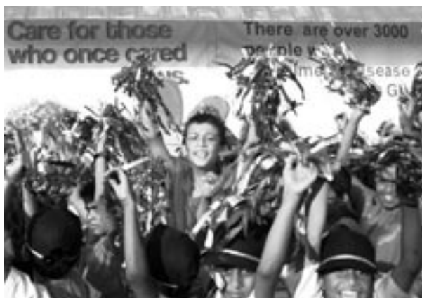
Adding colour to lives at the Goa Carnival, India

Marking the centenary year of Alzheimer's disease, the message focused on the importance of adequate care for people with dementia as well as the need to recognise dementia as a disease rather than a natural part of ageing. Thousands of leaflets were distributed spreading the 'No time to lose!' centenary message.