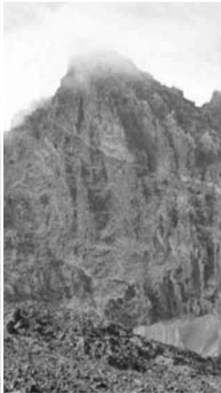
The impressive Mawenzi Peak, Mount Kilimanjaro

ADI is coordinating the Ascent for Alzheimer's: World Team with help from the Alzheimer's Society of British Columbia (ASBC), Canada. In the last eight years ASBC has helped put over