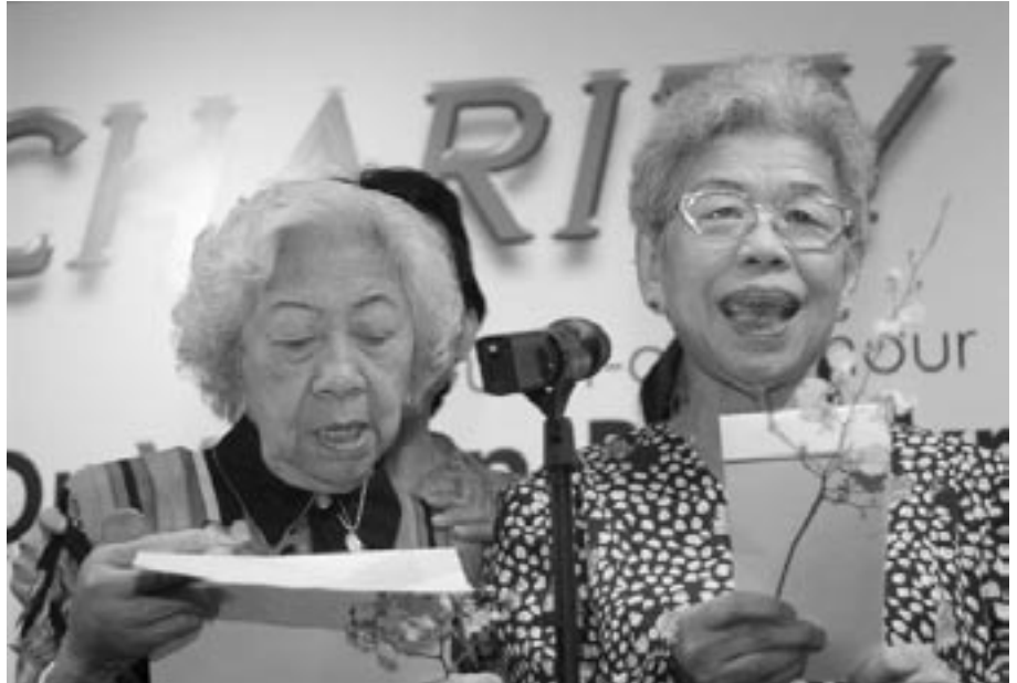
The New Horizon choir entertain guests at ADA's fundraising dinner in May