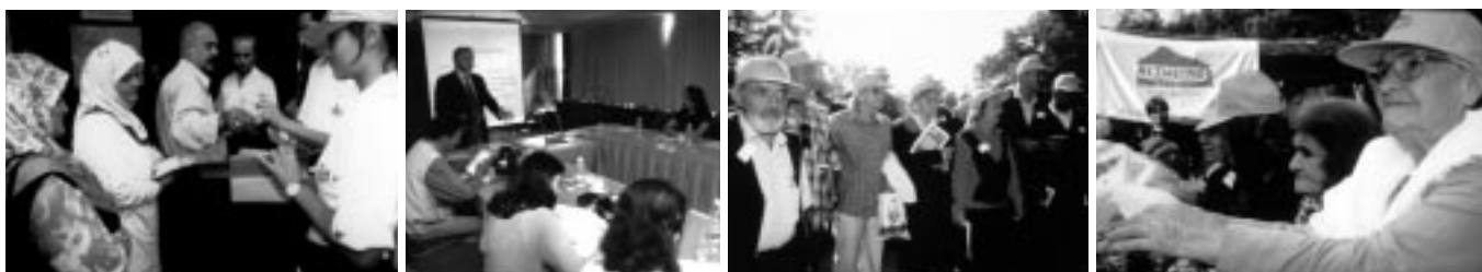
Some activities in Turkey for World Alzheimer's Day 1999

Why not let the Secretariat know how you celebrated World Alzheimer's Day? ADI would appreciate any photos you can send in (but please note that we are unable to return these).