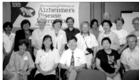
First Asia Pacific meeting

In June 1999 Alzheimer Europe held its 9th annual conference in London, hosted by the Alzheimer's Disease Society. It was attended by 600 delegates.