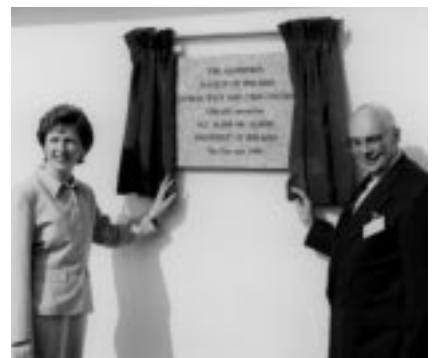
Opening of a new day centre in Ireland