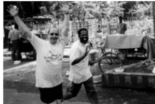
Fun run through the streets of Cochin, India

Lambie Nairn a leading international design company developed a World Alzheimer's Day logo for us which we launched in September 1998 and have since adopted as the new ADI logo. We would like to thank Lambie Nairn for the work they did for us.