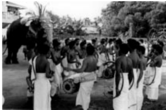
Traditional Kerelan drummers at the opening ceremony

Our 14th annual international conference was held in Cochin, Kerala, India. It was our first conference in Asia and was hosted by the Alzheimer's Disease and Related Disorder's Society of India (ARDSI). The theme of the conference was 'dementia the global challenge' – speaker after speaker reinforced the message that the numbers of people with dementia will increase dramatically as the world's population grows older.