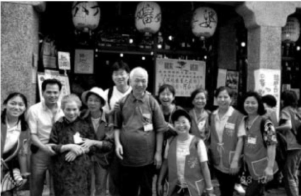
Members of the Taiwanese Alzheimer's Association distributing leaflets