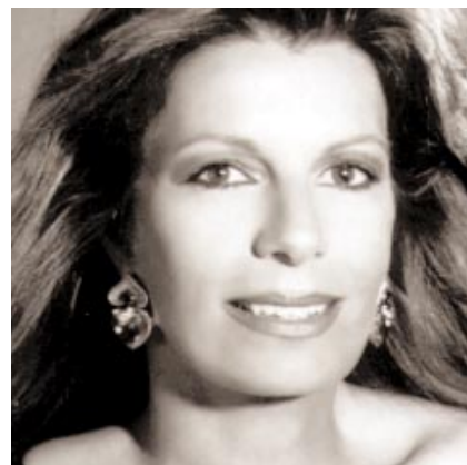
Princess Yasmin Aga Khan, President

As President of Alzheimer's Disease International, it is a real pleasure for me to celebrate its continuing growth and success. It is the commitment of our members which has strengthened the work that we do. Our continuing growth is crucial to reach out to the many countries where there are no Alzheimer associations and to raise awareness at an international level of the social and economic impact of dementia. With your help Alzheimer's Disease International will continue to develop new Alzheimer associations and expand the global network of help and support available to people with dementia and their families.